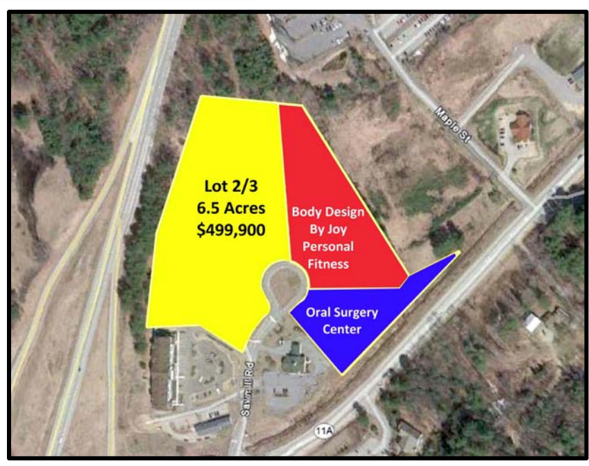
Lot 2/3$499,900 6.5 Acres

Email: <u>ksullivan@weekscommercial.com</u> www.weekscommercial.com